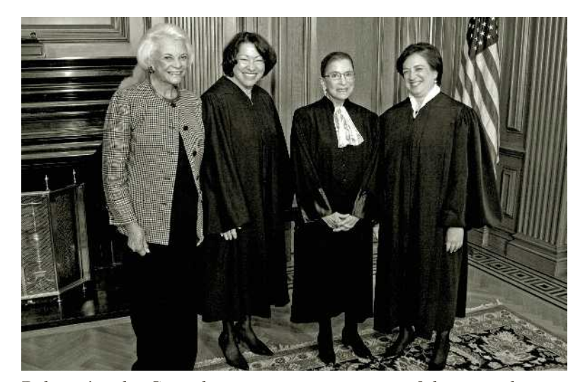
FIG. 5. The four female Justices in the Justices' Conference Room prior to Elena Kagan's investiture, Aug. 7, 2010.